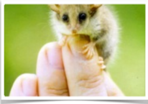
Mountain Pygmy Possum (Burramy Parvis)

ACT Wildlife Rescue • Rehabilitate • Release