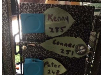
Animal names and weights written on gum leaves

textured baby clothes and flannelette pyjamas. These are recycled to make very attractive possum and larger marsupial beds, both practical and pretty.