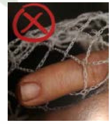
This example show BAD netting, the gaps are too large and a finger can pass through.