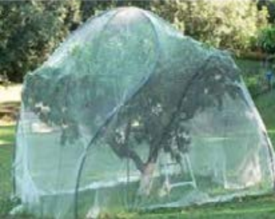
These two examples show how to correctly place netting over trees so wildlife cannot enter.